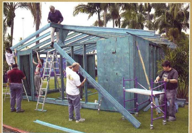
BluWood treatment on I-Wood scores big-time for 'pre-cycled' environmentalism