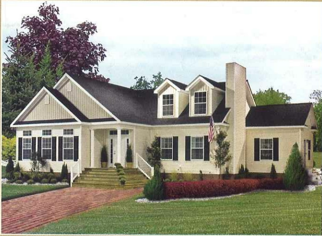
Graceful Jamestown model by Clayton Homes is one of over a dozen Best Seller Homes presented in this edition

The No. 1 Engineered Housing Technology Transfer Magazine for Manufacturing and Marketing